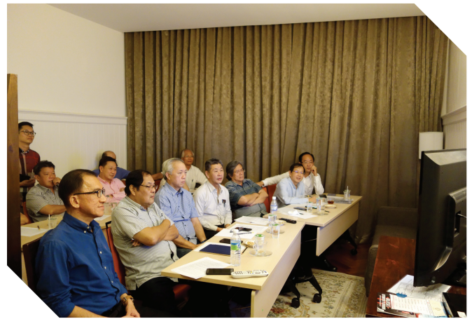
27/10/2017 收视2018年财政预算案公布之现场直播 Live Telecast Viewing of National Budget 2018