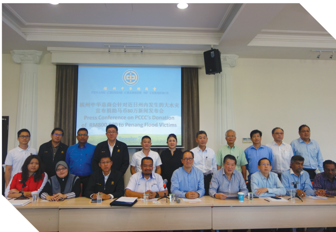
07/11/2017 槟州中华总商会联合马来西亚中小型企业机构召开新闻发布会—中小型企业紧急基金 PCCC & SME Corp's Press Conference on SME Emergency Fund