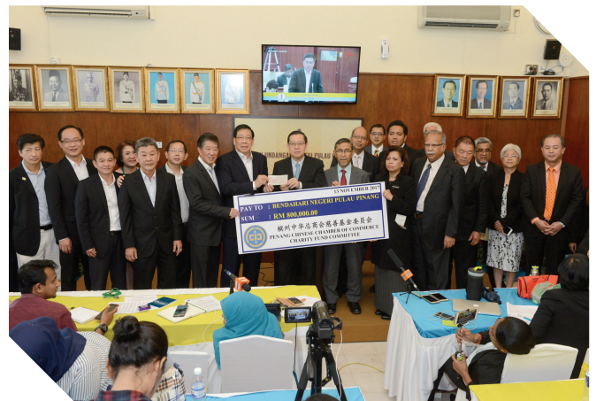
13/11/2017 槟中总捐助80万赈灾 PCCC's Donation of RM800,000 to Penang Flood Victims