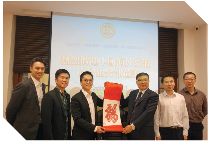
15/09/2017 中国海外交流协会研究部代表团莅访 Courtesy Visit by Department of Research, China Overseas Exchange Association