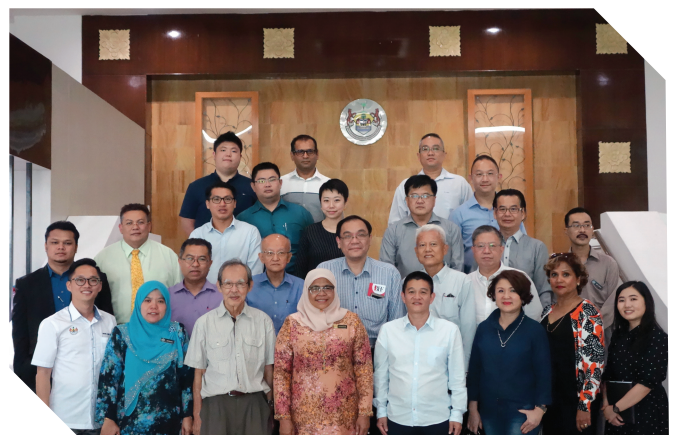
槟中总与马来西亚生产力机构对话会 PCCC Dialogue with Malaysia Productivity Corporation (MPC)