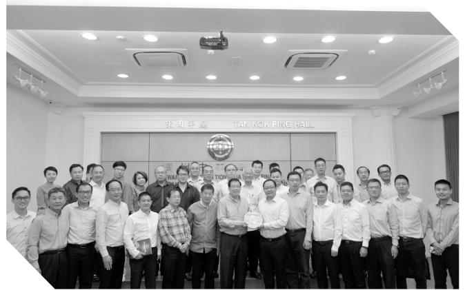
“2016年公司法令&中小企业融资&债务追偿”讲座 Seminar on “The New Company Act 2016 & SME Financing & Debt Recovery”