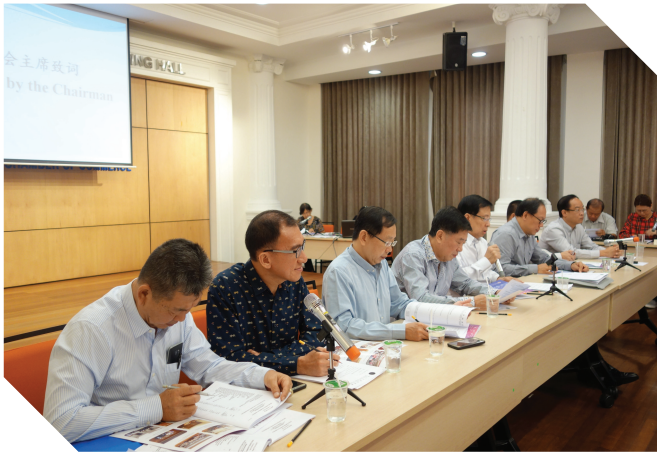
05/09/2017 槟中总2017年度常年会员大会 PCCC 2017 Annual General Meeting